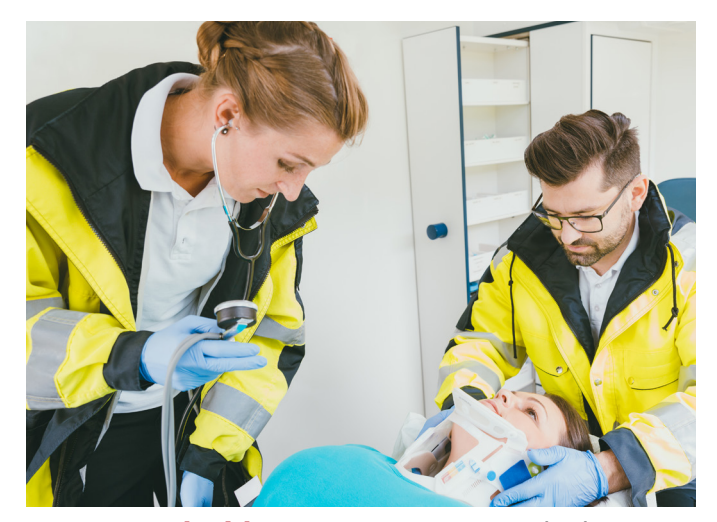
Common Job Titles: EMT, Emergency Medical Technician, First Responder

EMT's assess injuries and illnesses and administer basic emergency medical care which may include transportation of injured or sick persons to medical facilities.